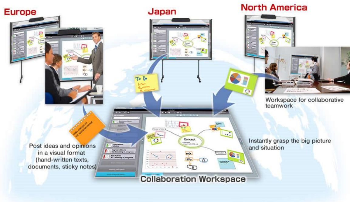
Figure 2: Collaboration between North America, Europe and Japan using Hitachi Advanced Collaboration System