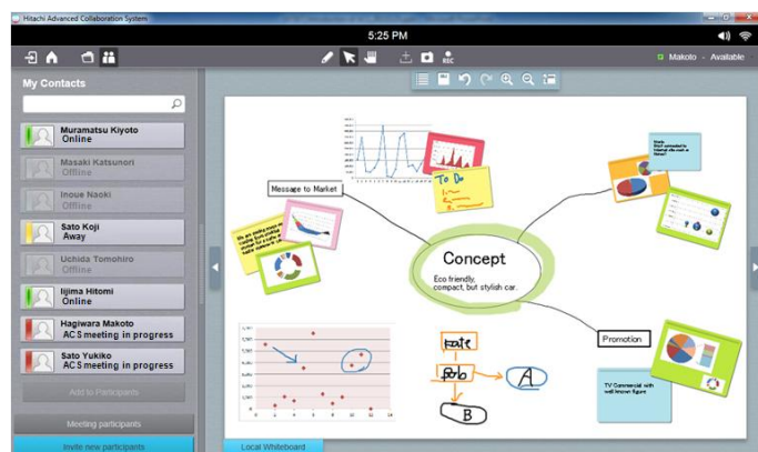
Figure 1: Screenshot of Hitachi Advanced Collaboration System

With the release of the Hitachi Advanced Collaboration System, Hitachi Solutions aims to develop the market for new collaborations systems, which have never been more vital than in today's increasingly global business environment.